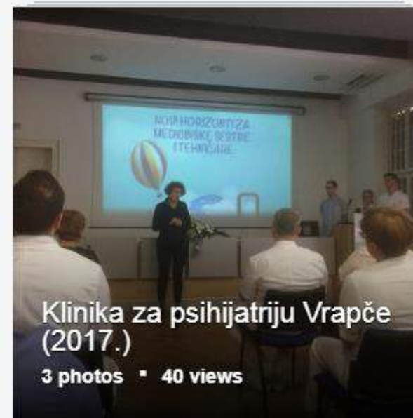
Klinika za psihijatriju Vrapče (2017.)