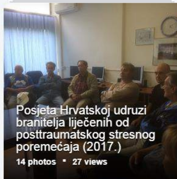
Posjeta Hrvatskoj udruzi branitelja liječenih od posttraumatskog stresnog poremećaja (2017.)