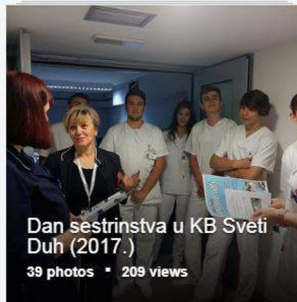
Dan sestrinstva u KB Sveti Duh (2017.)