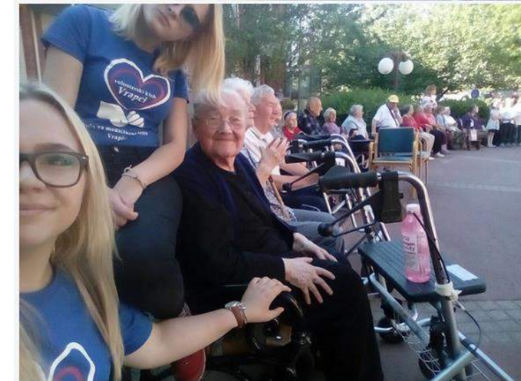
Volonters in action!