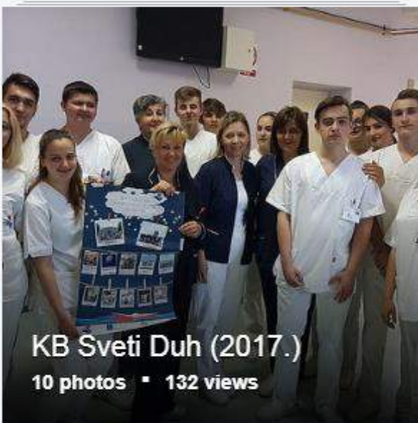
KB Sveti Duh (2017.)