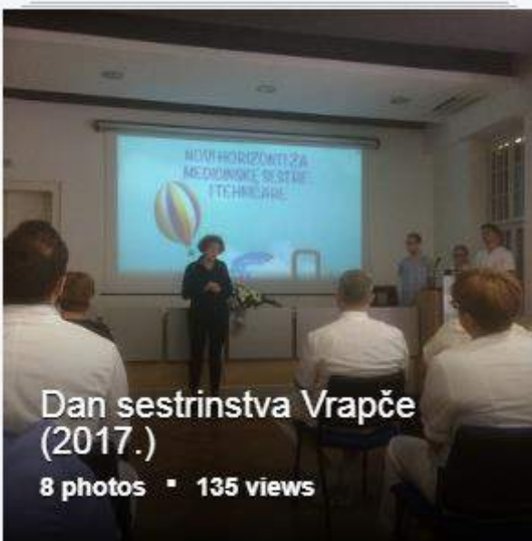
Dan sestrinstva Vrapče (2017.)