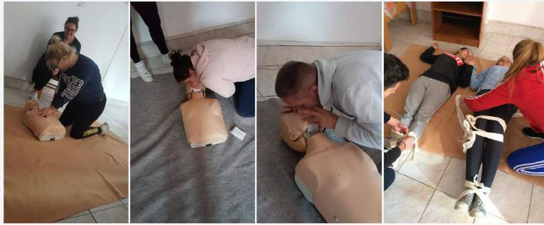
Practicing First Aid...