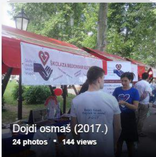
Dojdi osmaš (2017.)