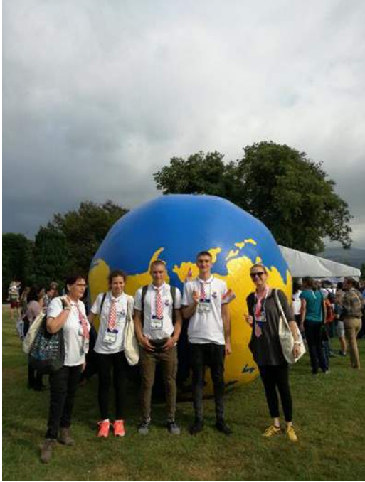
International GLOBE meeting in Ireland, 2018.