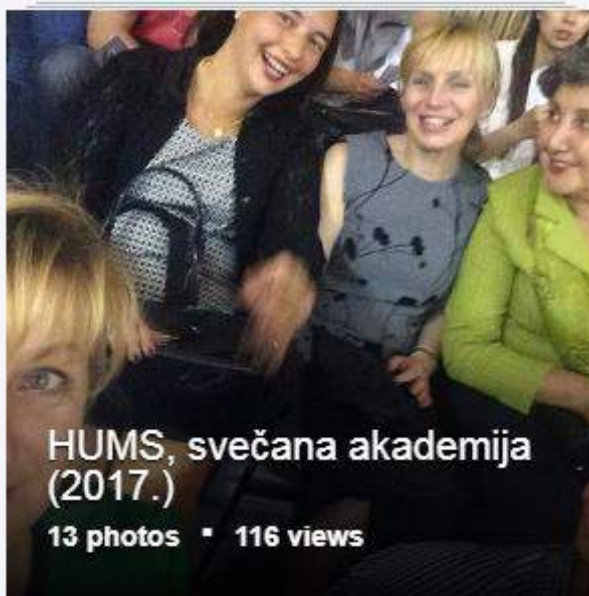
HUMS, svečana akademija (2017.)