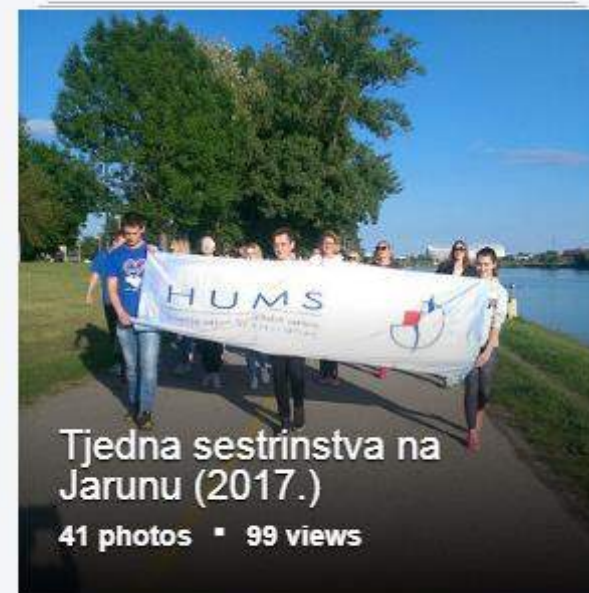
Tjedna sestrinstva na Jarunu (2017.)